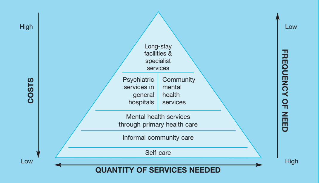
Figure 3. WHO-recommended optimal mix of services

The largest proportion of mental health care ought to be self-care management and informal mental health services.